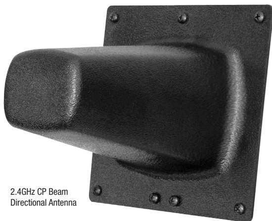
2.4GHz CP Beam Directional Antenna

Pliant Technologies, LLC 205 Technology Parkway Auburn, Alabama 36830 USA www.plianttechnologies.com Phone +1.334.321.1160 Toll-Free 1.844.475.4268 or 1.844.4PLIANT Fax +1.334.321.1162