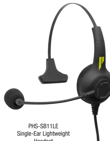
PHS-SB11LE Single-Ear Lightweight Headset