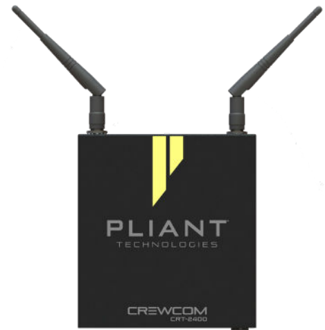
CRT-2400 / CRT-2400CE* 2.4GHz Radio Transceiver (Front View)