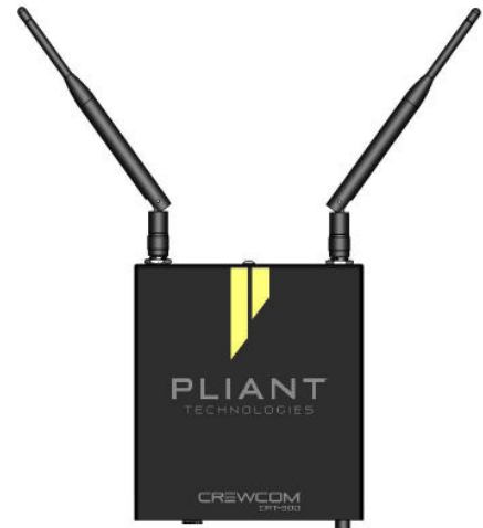
CRT-900 900MHz Radio Transceiver (Front View)