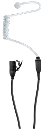
PHS-LAV-DM Lavalier Headset