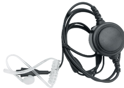
PHS-LAVPTT-DM Lavalier Headset with Push-To-Talk Button

Pliant Technologies, LLC CrewCom® 205 Technology Parkway Auburn, Alabama 36830 USA www.plianttechnologies.com Phone +1.334.321.1160 Toll-Free 1.844.475.4268 or 1.844.4PLIANT Fax +1.334.321.1162